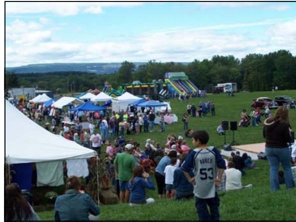
Great weather provided a stellar view of the Shawangunk Ridge from the Thomas Felten Community Park, where Plattekill Day was held.