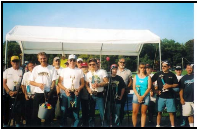
Car Show Winners at Plattekill Day 2006