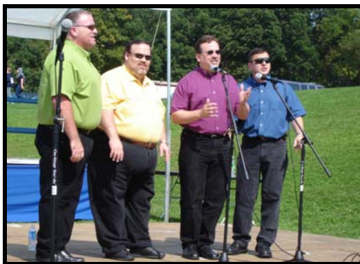
The Quartet "Swing Shift," performing at Plattekill Day 2006