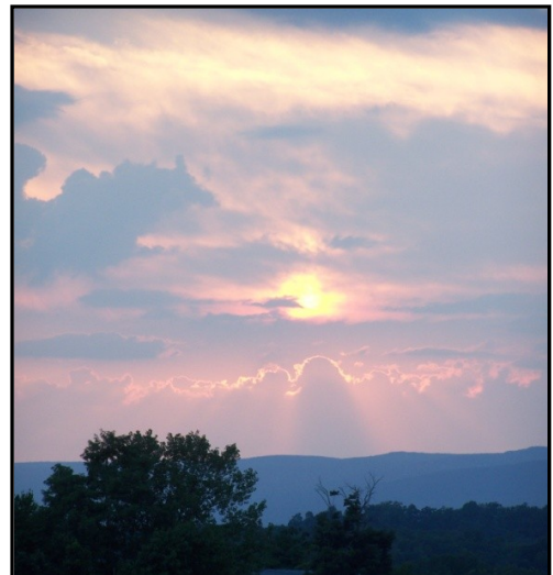
A beautiful sunset over the Shawangunk Ridge showed itself during the Sunset Serenade on August 8th, 2010.