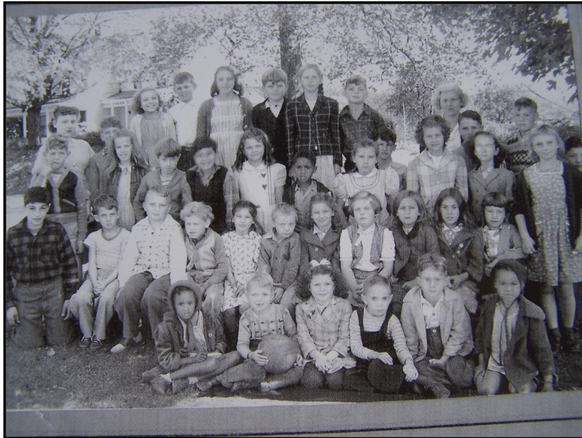
Students in front of the Modena School, sometime between 1947 and 1951. This was taken on the front lawn of what is now the Plattekill Public Library.

This jogged my memory to recall my Aunt saying her phone number as MO7 – 1449, which back then was Mount Vernon. Ahhh, the brain isn’t dead yet!