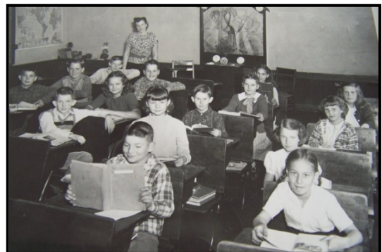
Classroom photo at the Modena School, sometime between 1947 – 1951.