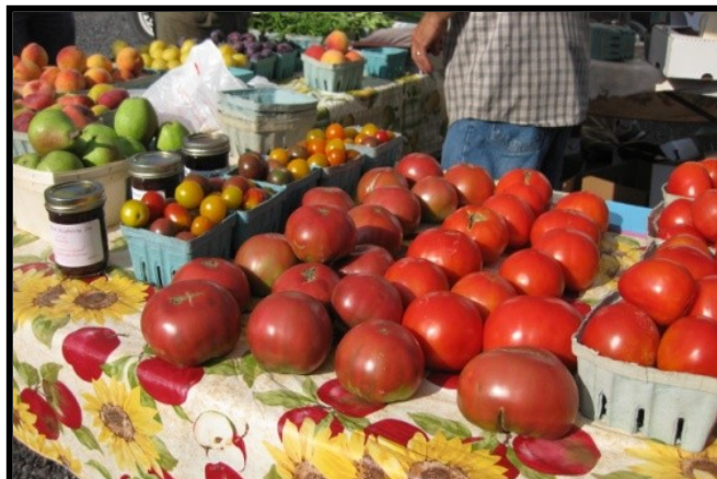
A small sampling of fresh food available at the Plattekill Farmer's Market.